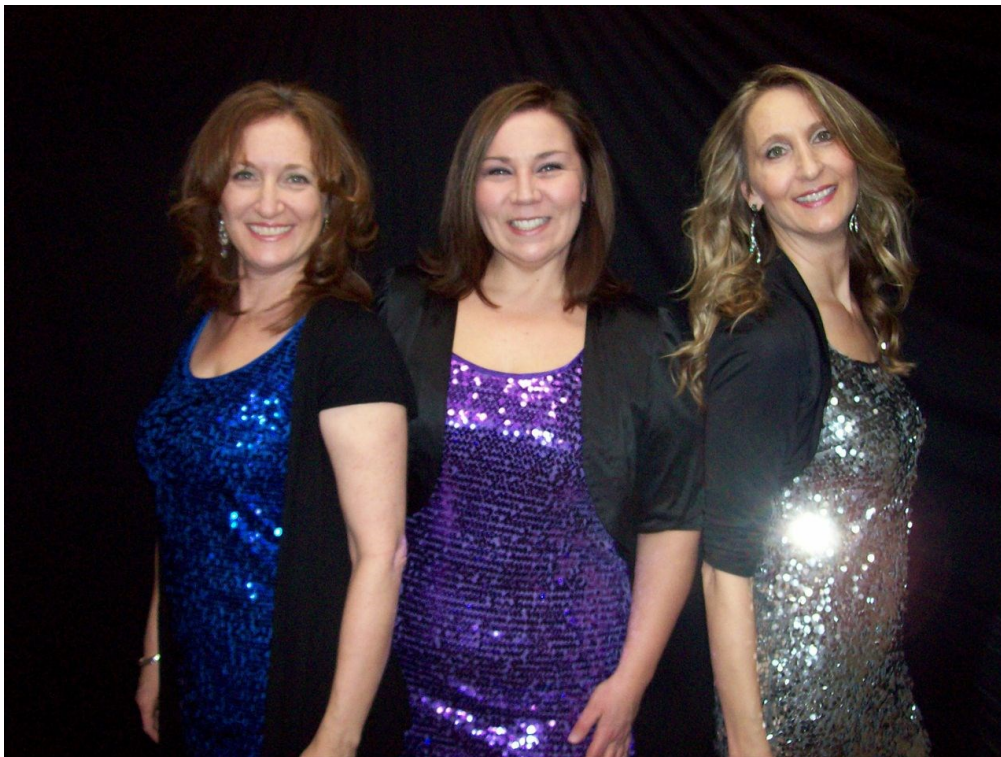
Some of the entertainers from the Hamilton All Star Jazz Band who will be performing at the A Century of Service gala on November 2.